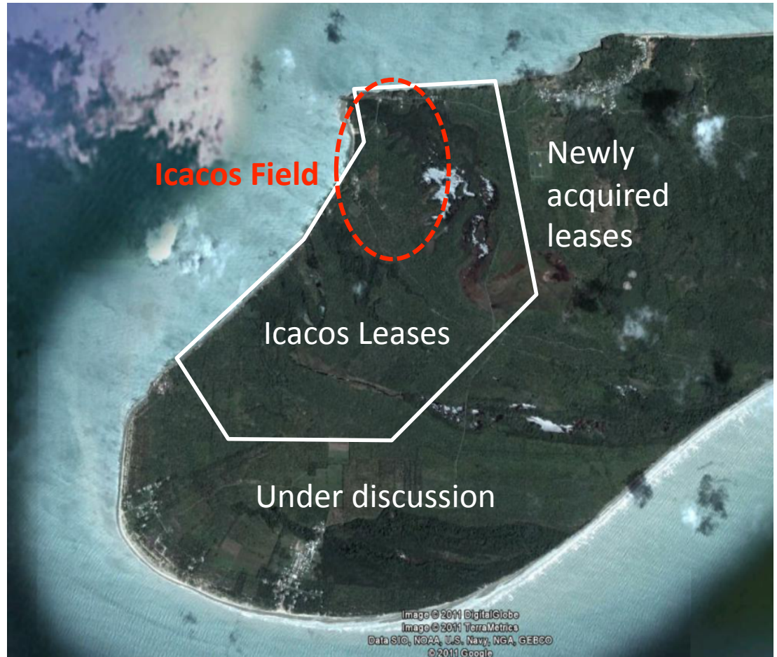
Cedros Peninsula land position