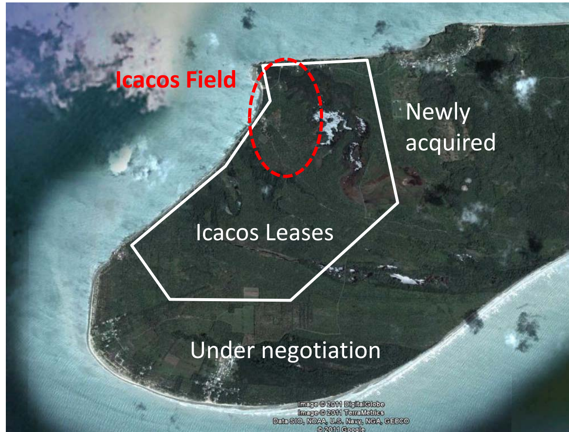
Cedros Peninsula land position